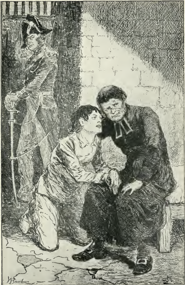
The Corsican at once knelt down and pretended to be about to confess